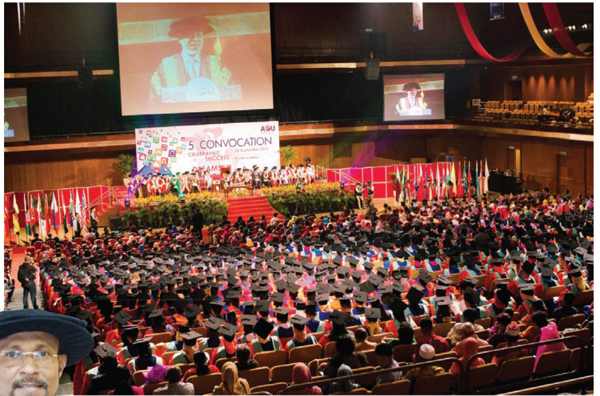
AeU's 5th convocation ceremony was held at Putra World Trade Centre.